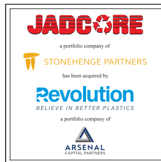
RECYCLING & FLEXIBLE PACKAGING