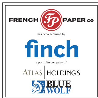
SPECIALTY PAPER & LUXURY PACKAGING