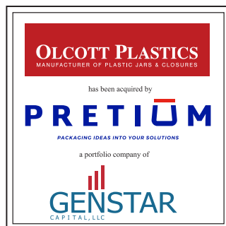
INJECTION & BLOW MOLDED PACKAGING